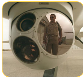
Antenna /Camera Stabilization

The VG800CA can be configured as a high performance IMU for integrated navigation systems, or as a vertical gyro for stabilization and control applications. Output data is available in both analog and digital formats, and a VG700-compatible mode is available for customers converting from the VG700 to VG800.